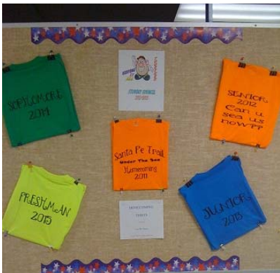
Class Homecoming Shirts on Display

To celebrate Homecoming, the SFTHS Student Council began meeting in June to plan activities for the week. During that time, students picked a theme, developed ideas for class t-shirts, and planned special building activities for each day of Homecoming week. The “Spirit Week” will be held from September 19 – 23. The annual KAY volleyball tournament will be held that week as well as the bonfire to promote school spirit.