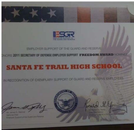
Certificate of Recognition