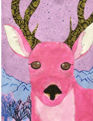
"Yes, Deer!" By Kylee Burgoon