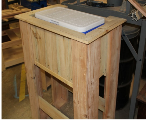
Ice chest cabinet