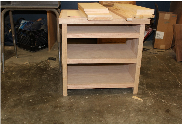
Two drawer bedside cabinet