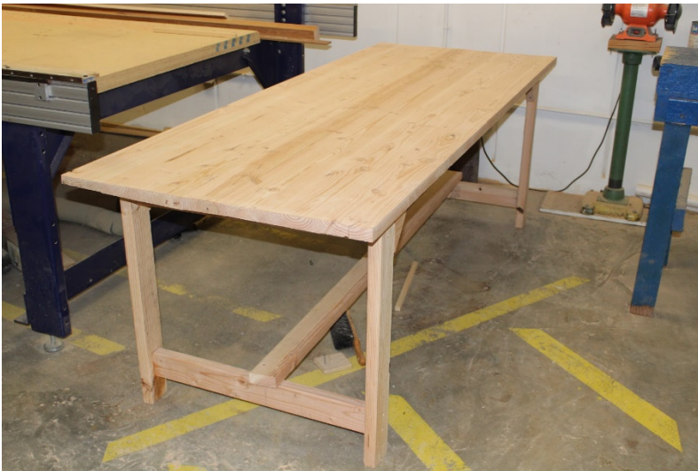
8' long farm table