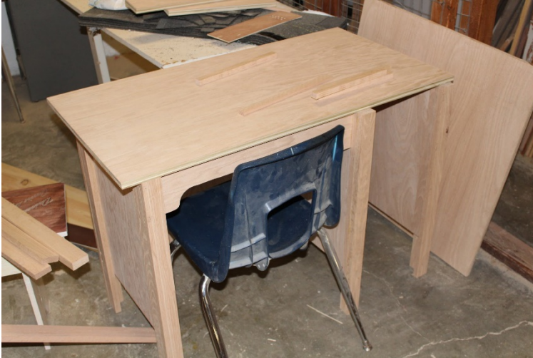
Desk with future drawers