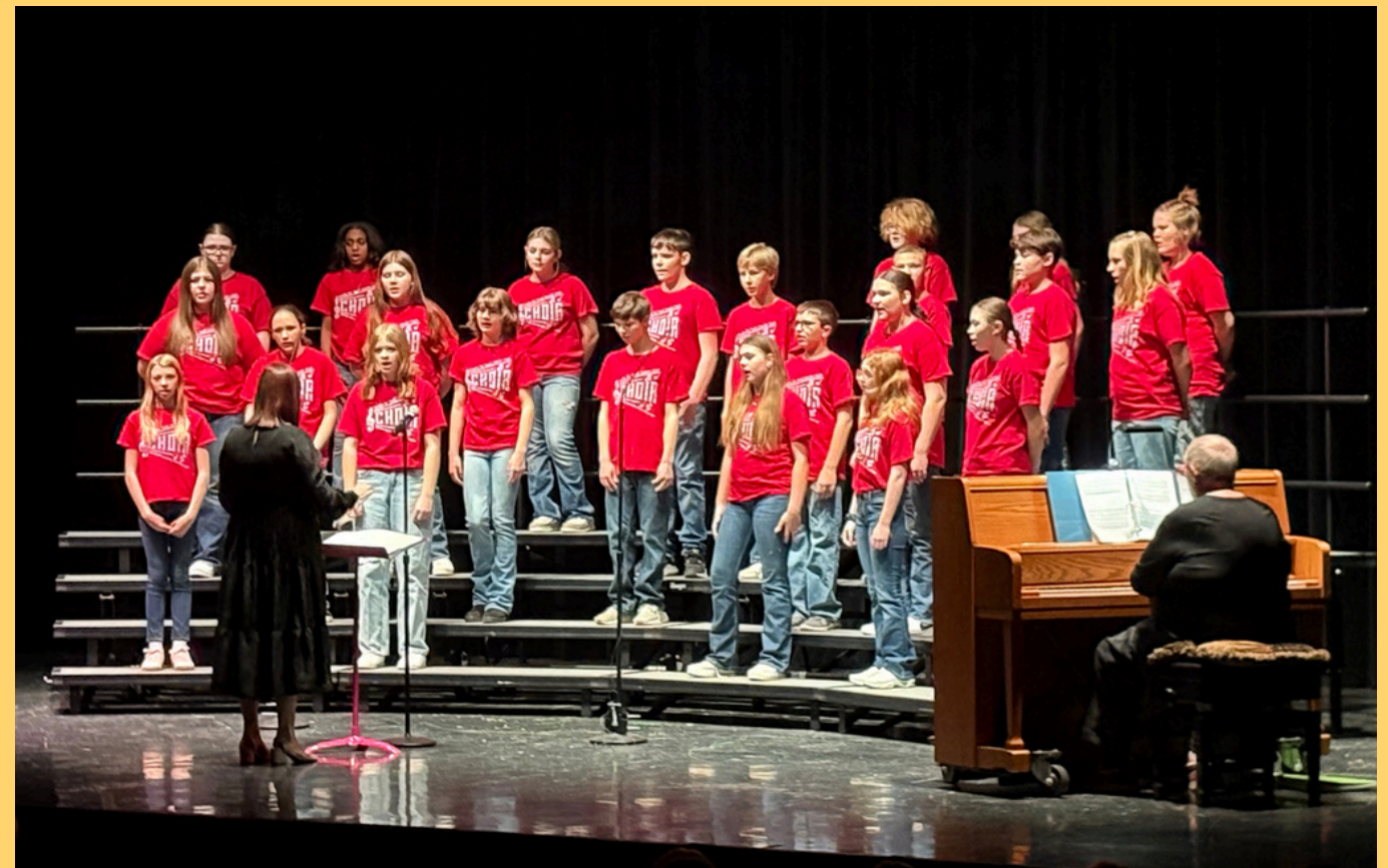
JH Choir performing in their Combined Spring Concert with SFTHS Choirs in March.

6th Grade/JH Choir Combined Concert - May 6th @ 7pm